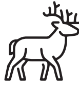
NATURE & ANIMALS