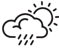
WEATHER & CLIMATE