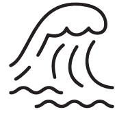
OCEANS & LAKES