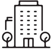
CITIES & PEOPLE